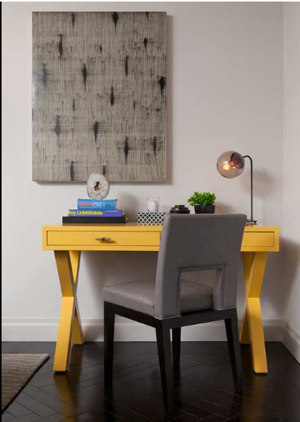
Park Avenue residence by Darci Hether

Building upon a grey backdrop, Hether has developed a materials palette that harmonises the different areas of the apartment with dark stained timber flooring, marble tiles, horsehair wallcovering and (my favourite) slate tiles. The furnishings are characterised by handsome upholstered pieces with clean lines and a tendency towards comfort with the fixtures showing Hether's commitment to serious quality, the Lindsay Adelman light above the dining table being foremost among them. In the end, it really doesn't matter who lives here, the point is this apartment is a cool, calm and collected expression of New York City.